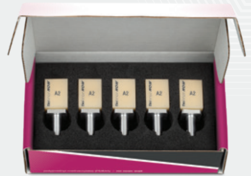
Sold in 5-block packs